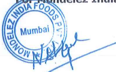
Vishal Gayke Procurement